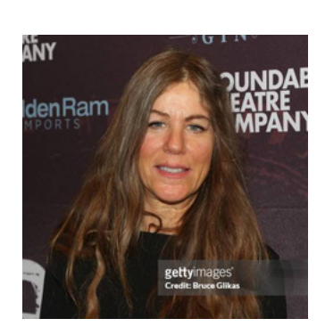
Marci Klein NBC Universal